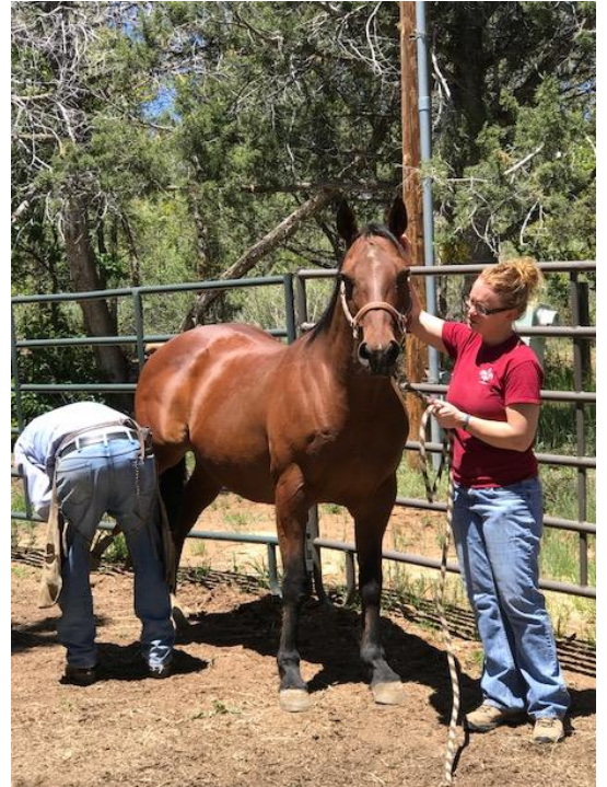
Summer & Comet

Right now, I'm currently finding humor in the "babies" Peanut, Ashley, and April. The minute I walk into their pen they are interested in whatever I am doing and get as close as possible. They clearly don't know what personal space means and are a curious bunch! If I am cleaning out their water buckets or mucking their pen, I'll occasionally feel someone tugging on my shirt or smelling my hat. When the water is filling in the water bucket Peanut likes to pick up the hose with her teeth and splash the water around and April likes it when I gently splash the water and rub some on her nose. In the end, they are playful just like all babies and looking for as much attention as possible...which I'm more than happy to give to them and receive from them in return as that can be hard earned at a horse rescue. With so many horses at the rescue not knowing what it's like to trust humans, it makes me happy to know that these horses will have a safe place to learn what healthy human to horse bonds mean and it makes me even happier to be a part of it.