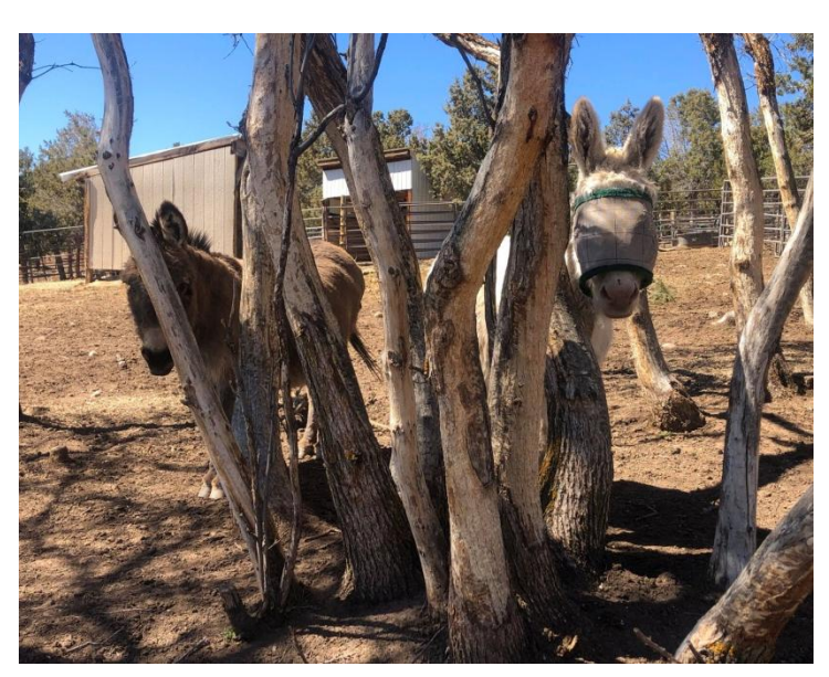
Dusty and Dewey

The horses are all wonderful, (well healthy anyway, wonderful would suggest well mannered) although grass starting to come up make's them all about like cats on nip.....everyone is shedding & needs groomed, but only so many daylight hours- scrubbing waters is more Important than everyone looking pretty & then rolling in the mud directly after. Blue birds are busy building their nests, daffodils are getting ready to tell us spring is here