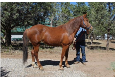
Sedona looking nice n' tall

Don't forget our annual Open house/garage sale on June 28th & 29th, we are now taking donations of salable items.