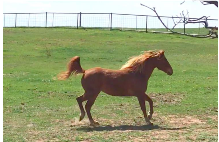
Ruby last week

Ruby was rescued from a feedlot at 3 months and is now 3 years old. She is a Polish Arabian filly with a gorgeous Sorrel / Flaxen mane and tail. In your pocket, easy to catch, does feet and loves to be handled. She loves people, has recently begun to find her confidence and is an absolute dream girl! Typical of her breed she will not be mature until she is about 5 & THEN will be ready to start under saddle. She is the last of the babies we have left! Waiting to find her forever home.