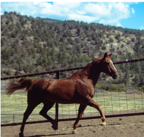
Candy out in pasture

Candy looks MAGNIFICENT, demands her breakfast by flipping her feeder against the wall & making quite the racket.