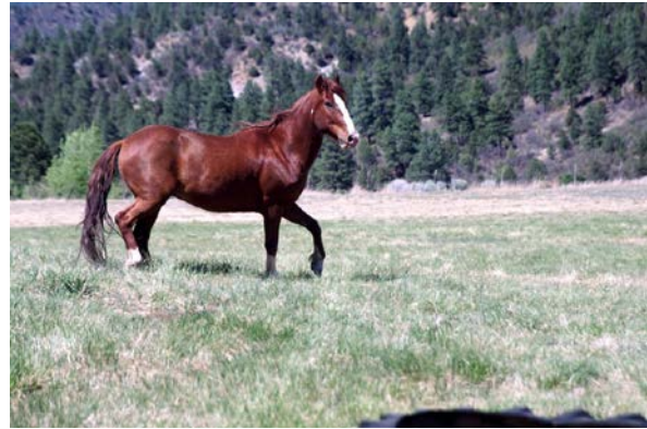
Pacino looking handsome

and before I knew it, I was speaking to an advisor about what I wanted to major in and what classes I should take. Truth be told, I really didn't know what I wanted to major in. In the fall of my freshman year I started coming the rescue. I was looking to do something different, and I had never been around horses and had no experience with them. It seemed like it might be a cool experience. Soon enough I had a routine and