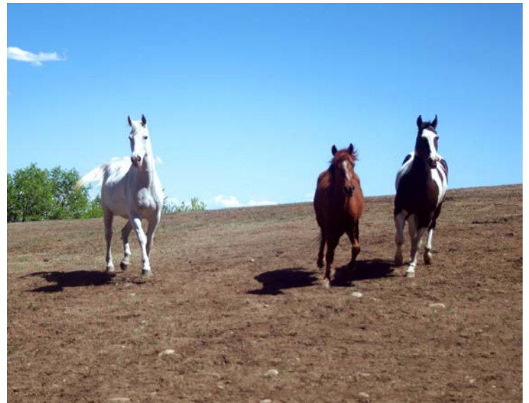
Left to right: Watchman, Spirit, & Asta

Spirit is almost a four year old Sorel gelding with a white strip on his head. He stands at almost 14 hands high. He was rescued when he was six months old from a kill lot in Texas. Since he has matured he has been used as a show horse for children in hunter jumper shows. He is such a lover and so willing to please! He is so much fun to ride! Watchman is a 23 year old warmblood. He is over 16 hands high and is light grey in color. He was also rescued from a kill lot. He had the words Therapy spray painted across his body because he has been used as a therapy horse. Watchman is a big gentleman, and when you look into his eyes you see all the knowledge and wisdom in them. He will make any rider feel comfortable and confident. They are both settling in quite nicely at their new home awaiting the start of the summer lesson program.