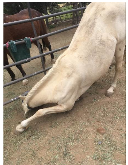
Bonus doing some yoga