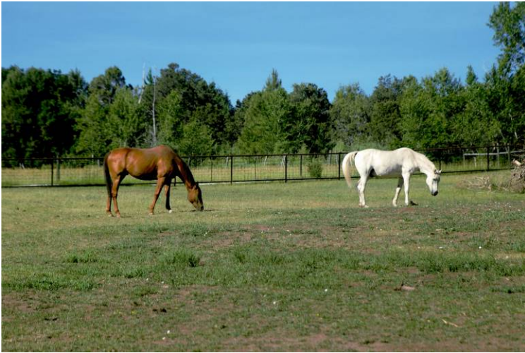
Ridge and Keester on pasture

Volunteering at the horse rescue for me has been a great learning experience. I show up the first day to meet Diane and after our hello she is immediately headed to the barn scooping up food, mixing medications, and special food for some of the horses, telling me which horse gets what and away we go.