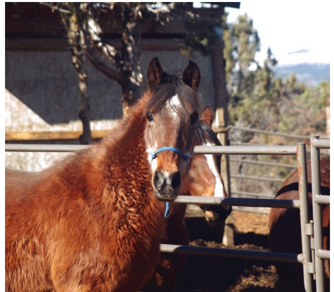
If you so much as whisper "carrots" Tambara will give you this look.

horses, irrigation repairs, sheds that need attention, gates that don't work, and the list goes on. We even made tennis shoes (1" dense foam and duct tape) for Ridge because his front feet were very ouchie after trimming.