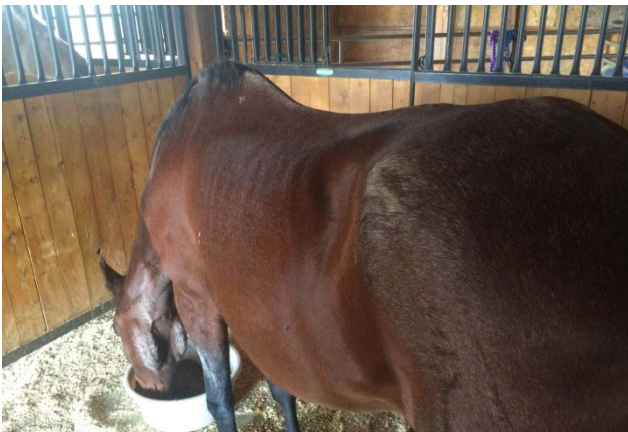
Fancy after a month here, already gaining weight.

One of the beautiful things about Spring Creek Horse Rescue is how dedicated the Rescue is to the horses that come through here. We have seen Fancy on several other occasions, but when we heard