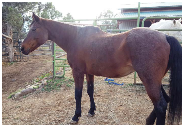
Fancy today, much plumper and just as sassy.