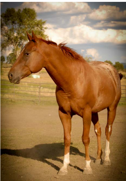
Colton, looking gorgeous.