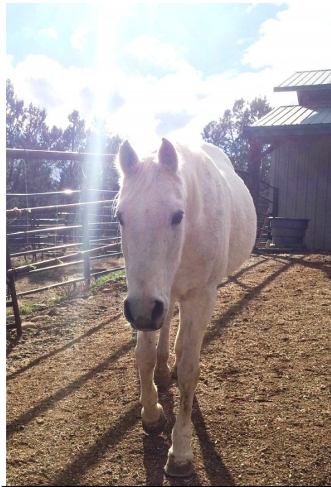
Keester - still super cute at 33!

Snip is a gorgeous 15 hand- plus bay Quarter Horse gelding. His career was at a working cattle ranch. He is 21 year old and unfortunately, he suffered a stroke shortly after his arrival at the Rescue, but he is a lover and is learning to get around pretty well again. He sustained a stifle Injury when he fell (among other injuries that have healed) and is now bright and perky, but will not be able to be ridden again. He loves attention and is a good "teacher horse." He thoroughly enjoys life and is a good example for kids and adults to learn how to