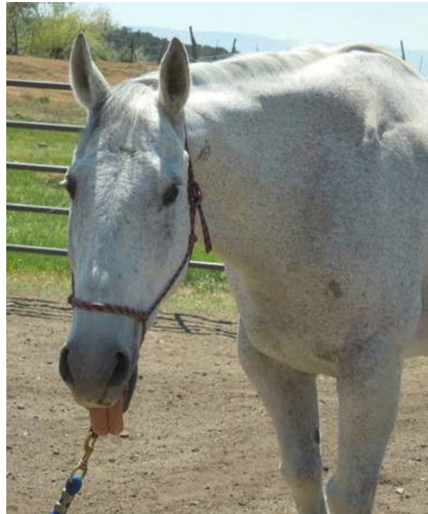
Samuel showing off his sense of humor!

We have Samuel, a flea-bitten fifteen hand- plus Quarter horse who was successful on the competitive show circuit. Samuel came to us with selenium poisoning. Most of his hair had fallen out, his tail was gone, and his feet looked like waves on the ocean. He is an ex-roping horse that was ridden until his knees were too big to ride anymore. He is 40 years old this year and one of the best looking examples of attitude you've ever met! He is bossy and opinionated and lets you know he is "in charge" & would like his dinner NOW!! Because of his knees and his age, his forever home is here at the Rescue where he enjoys munching knee high grass in one of our pastures.