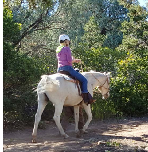
Riding off into the sunset. :-)