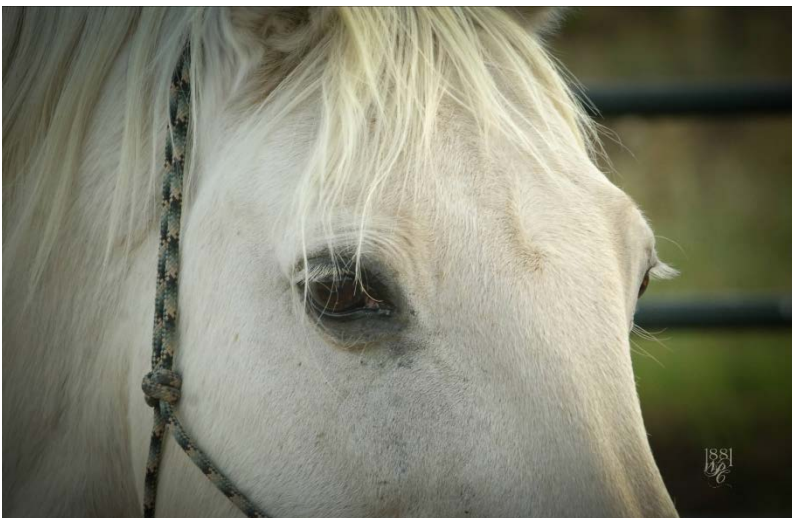
Beautiful Lilly, showing her sensitive side.

Lilly, Samuel's corral mate, is a large gray Quarter Horse and was used as an all purpose ranch/work horse. She has a bit of a wave to her mane and tail, which suggests maybe a Spanish breed in her background. I personally think she is one of our most beautiful.